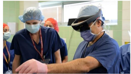
Figure 1. Neurosurgeon using the HoloLens to denote the surgical access point and trajectory.

REFERENCES: [1] Meola et al. , Neurosurgical Review , 2017.