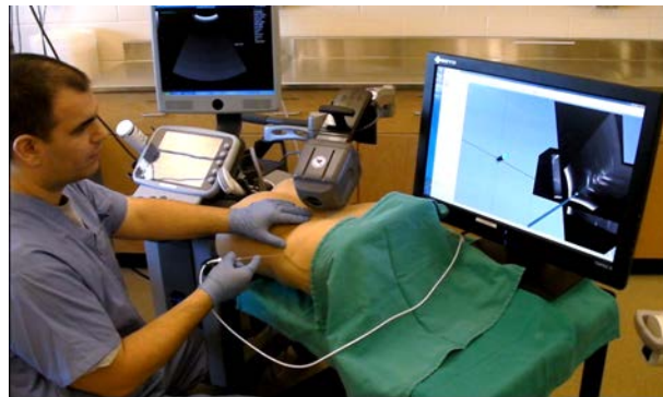
Fig. 2: Ultrasound-guided nephrostomy navigation system built from SlicerIGT platform components.