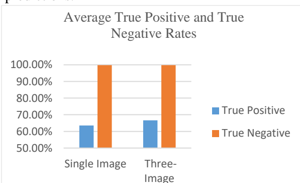
Figure 2: Comparison of average true positive (blue) and true negative (orange) rates between single image (left) and three-image input (right)

RESULTS: After comparing the single to five-image input arrays, the three-image input had the best performance in terms of true positive value. The single input and three-input images were then further tested. The single image input neural network had a true negative rate of 99.79%, and a true positive rate of 63.56%. The three-image input neural network had a true negative rate of 99.75%, and a true positive rate of 66.64%.